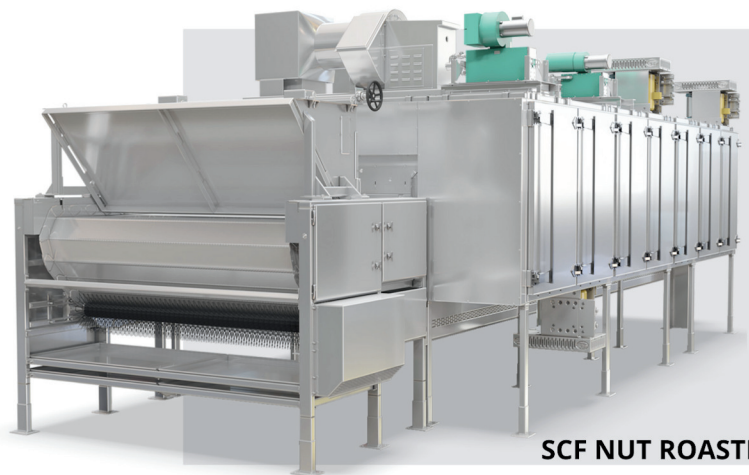
SCF NUT ROASTER