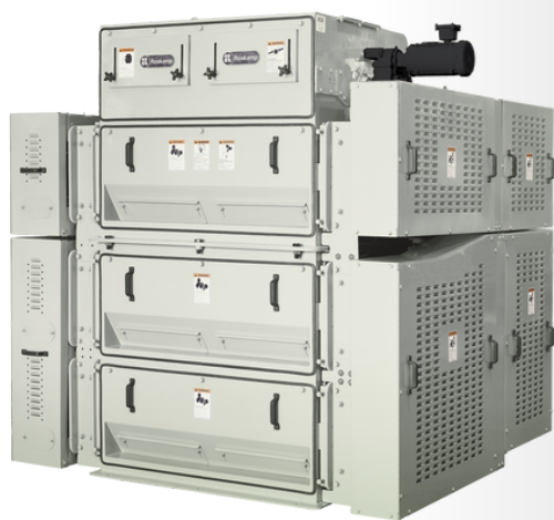
ROSKAMP RM/HX 1200/1600 ROLLER MILLS